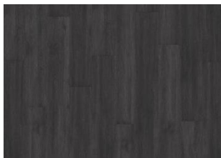
Schwarzwald - Click 5 mm