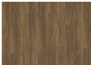
Redwood - Click 5 mm