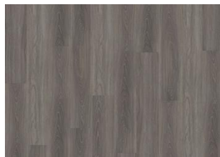
Wentwood - Click 5 mm