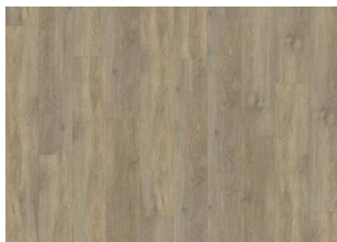
Taiga - Click 5 mm