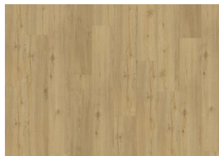
Oulanka - Click 5 mm