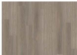
Whinfell - Click 5 mm