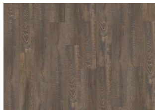
Kannur - Click 5 mm