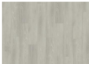
Yukon - Click 5 mm