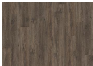
Saxon - Click 5 mm