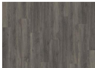
Niagara - Click 5 mm