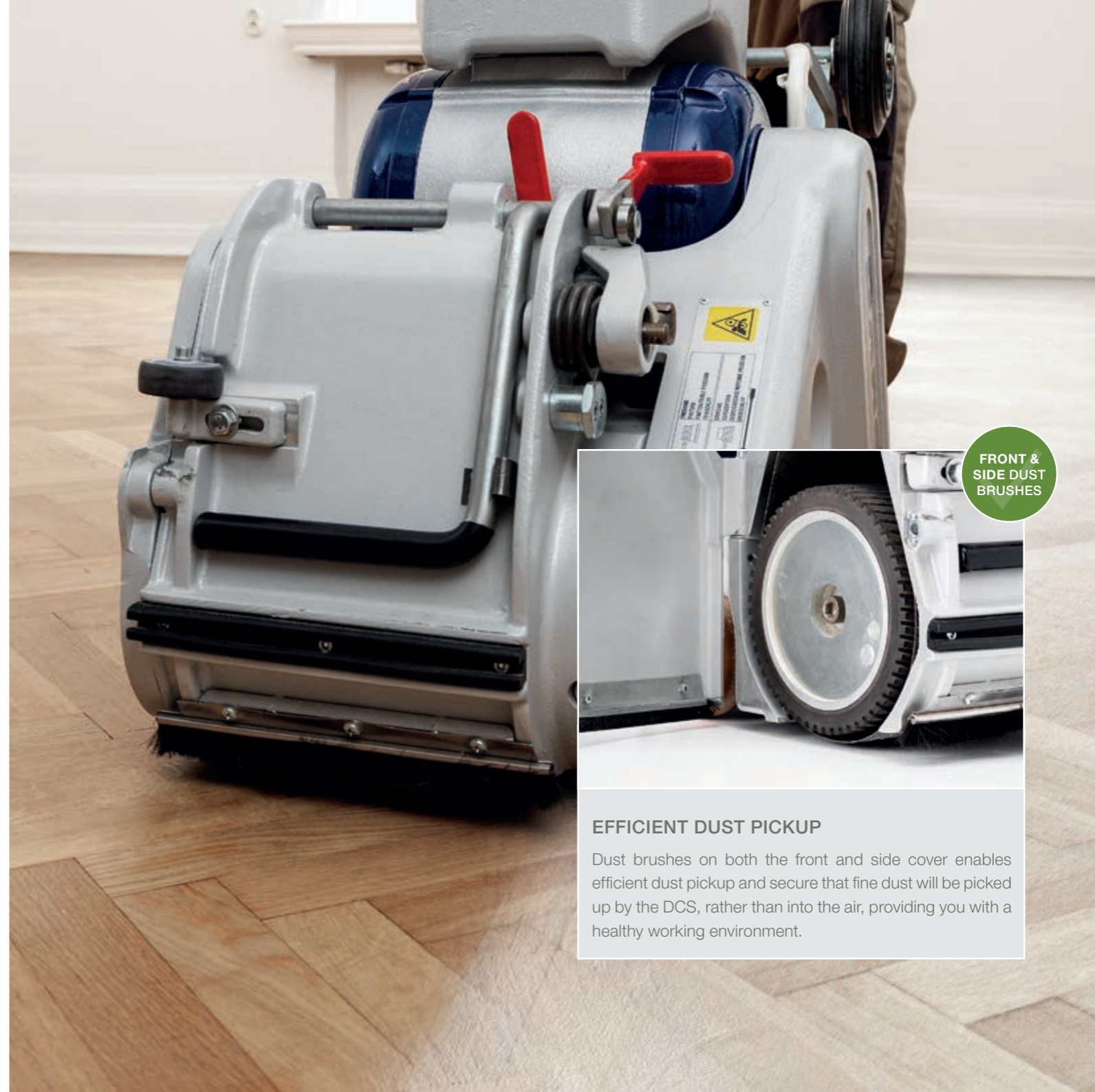
FRONT & SIDE DUST BRUSHES

The integrated connector enables the machine to be connected to all possible dust containment solutions; Bona DCS 70, DCS 25, standard dust bag and disposable dust bag. The connector ensures that these different options are easily attached and can be used hassle-free, without any alterations.