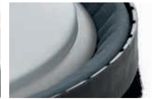
Dust protection skirt on cover plate is self-adjusting in height