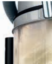
Unique 2-step cyclonic filter separation process