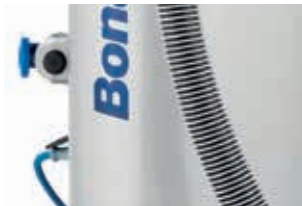
Fully sealed system keeps indoor air perfectly clean