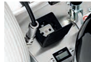
Power outlet for optional accessories