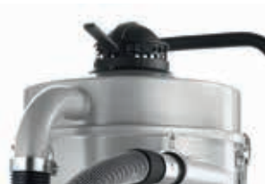
Pressure release valve for easy filter clearing