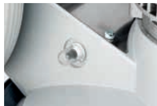
Thermal and power overload fuse ensures operational safety