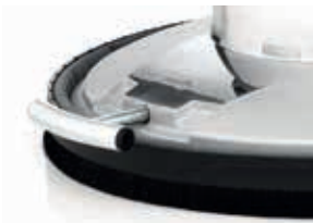
Handles on the cover plate make it easy to carry