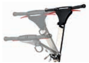
Folding and stepless shaft adjustment for easy handling