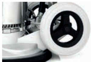
Large wheels for easy transportation